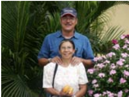
Blessed are the little children.....

God loves you with an everlasting and unconditional love. He will never leave you, or forsake you. Draw nigh to Him, and He will draw nigh to you.