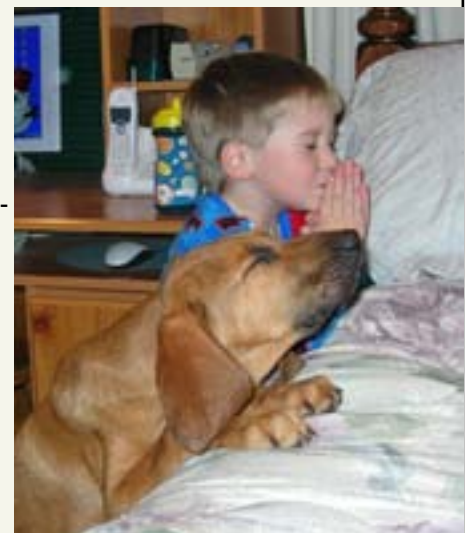
Pray Without Ceasing